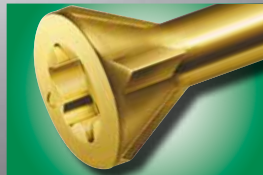
Small 60° milling head